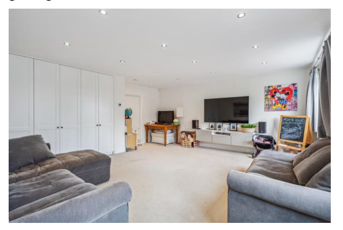
FAMILY ROOM: two double glazed windows to front, underfloor heating, fitted six door cupboards and downlights, door to utility room.

CLOAKROOM: with wood laminate flooring, low wc, washbasin in vanity cupboard unit, double glazing, radiator.