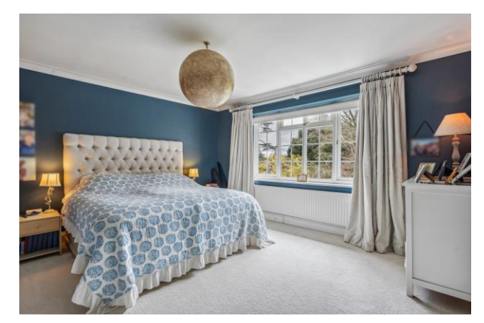
BEDROOM 1 with inner hallway, loft access, radiator, double glazed window overlooking garden. EN SUITE BATHROOM coloured suite of panelled bath with shower unit over with subway tiling low wc

FAMILY BATHROOM with underfloor heating, wood effect tiled flooring, four piece suite with large tiled shower cubicle, Burlington style taps and shower, panelled bath with Burlington Victorian style shower unit with rainforest head shower and hand shower and tap low wc with concealed cistern, pedestal basin , double glazed window to front, chromium heated towel rail, half-timber panelled walls, wall light points.